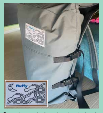
Swag logos, designed and voted on by the Beechworth Correctional Centre.

St Leonard's Uniting Church Brighton have been a key reason the program has been able to get off the ground.