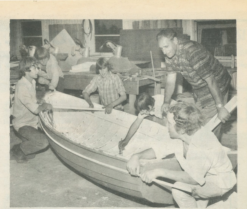
SKILLS in many fields develop under the guidance of volunter experts. Even boat-building and repair is included. Canoeing popular in the boating pool, a recent amenity.