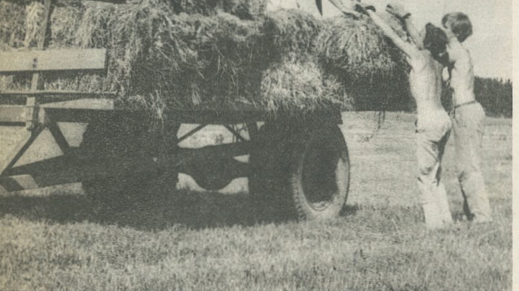
ILLING HANDS help load the hay on the tractor-drawn carrier.